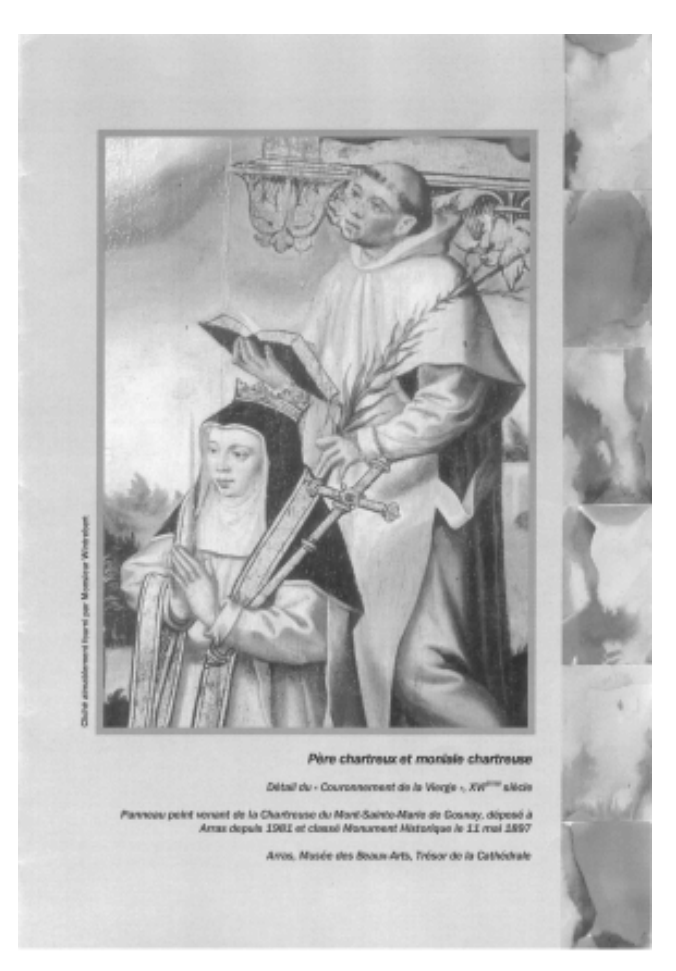
Figure 1: Detail from a unsigned 16th century painting called 'The Coronation of the Virgin' in the Musée des Beaux-Arts, section Trésor de la Cathédrale , in Arras, France. It shows the nun with all her insignia: the black veil (typical of the Carthusians), the ring and the crown, as well as the maniple (on her right arm) the stole and the large cross. A Carthusian priest is standing behind her. It is part of a panel which had originally been in the Charterhouse of Mont-Sainte-Marie de Gosnay. Carthusians generally did not sign their art work. (From the programme of the '1er Congres International d'Archeologie Cartusienne' held by the Université d' Artois at the Chartreuse du Val-Saint-Esprit in Gosnay from 22–25 2006)